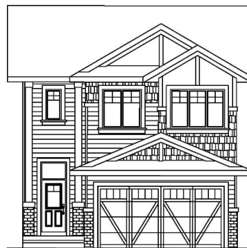
Inappropriate Style and ENTRY

The base of wood verandas/porches will be enclosed to grade. Verandas and porches (including the stair risers, railings, and stringers) must be painted to blend with the home, only the landing and treads at the veranda/porch may be left in a natural state.