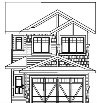
Appropriate Style and ENTRY

Entranceways will be covered at the first level and create a welcome sense of arrival at each home.